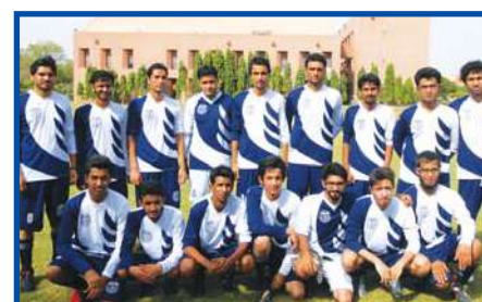
JMDC participated in 12-Inter-University Football Tournament held at AKUH Football Ground on May 16, 2014