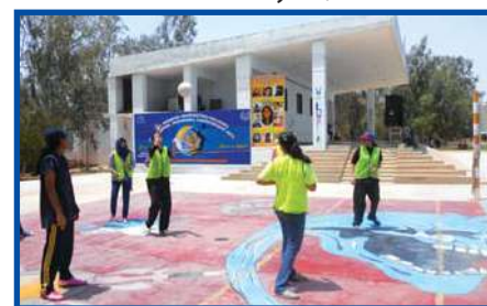
JMDC Girls Team participated in 12-Inter-University Throw Ball Championship held at Baqai Medical University Ground on April 24, 2014